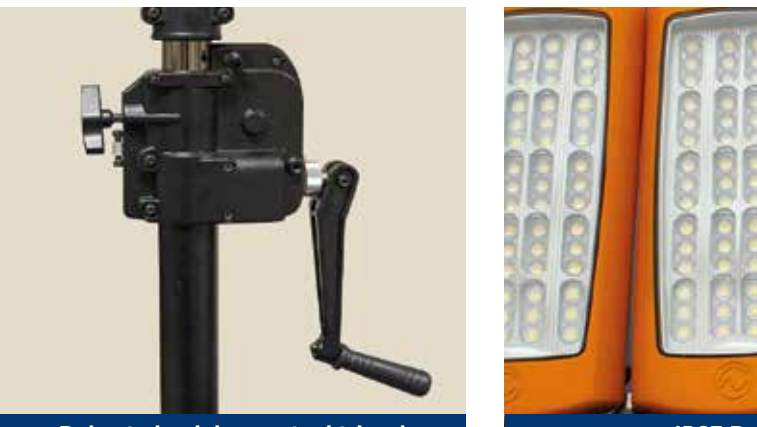
Robust aluminium + steel tripod with hand winch and safety locks