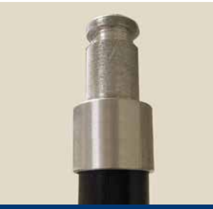
Universal DIN spigot fitting (30mm DIN 14640)

LCD programmable display: Light mode selection • Programme runtime up to 48 hours • Battery status by colour